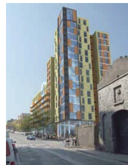
Bridgefoot Street development, Dublin