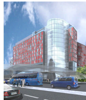
Dublin Airport Hotel, Dublin, Ireland