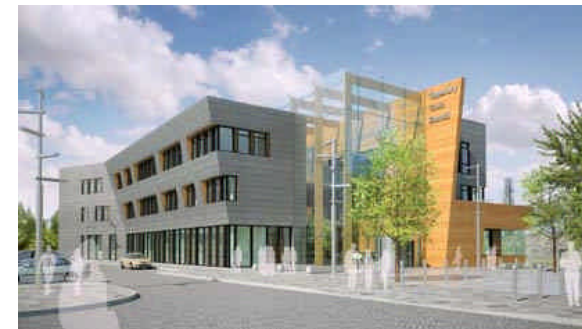
Tipperary Town Council, Tipperary Town, Ireland