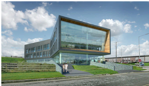
Balbriggan Development, Balbriggan, Ireland